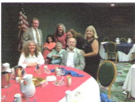
517 th PRCT Association Mini Reunion Kissimmee Florida January 17-20, 2014