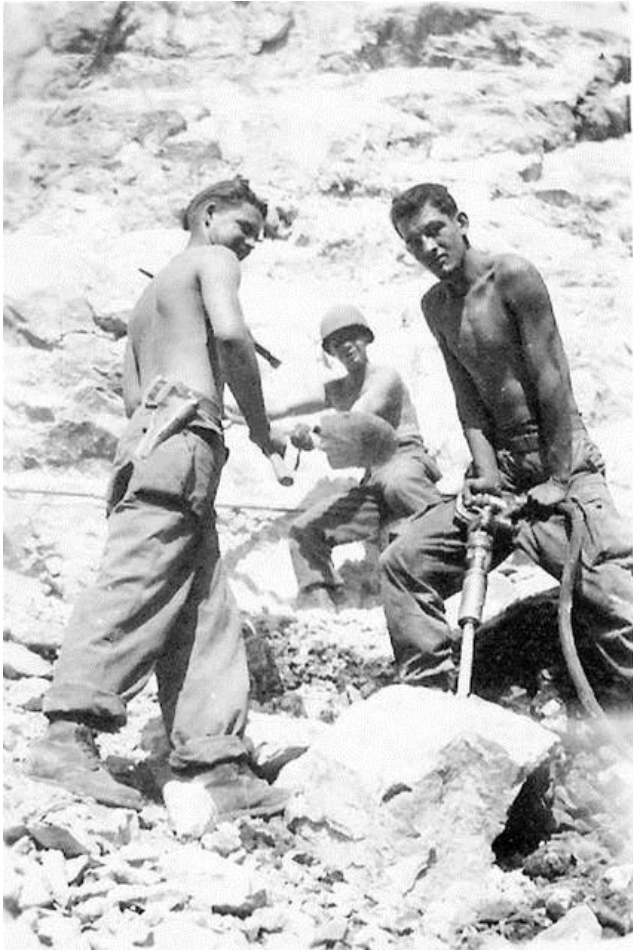
Men of the 1/596 Airborne Engineer repair the Col de Braus road. Mid-September 1944.