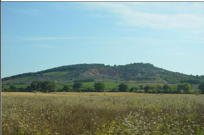
5) Monte Peloso seen from the East in August 2011.