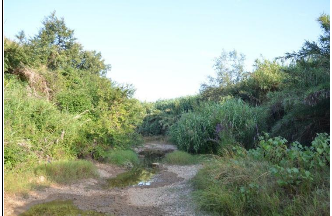
2) A view of the dry bed of River Cornia (towards west) in August 2011.