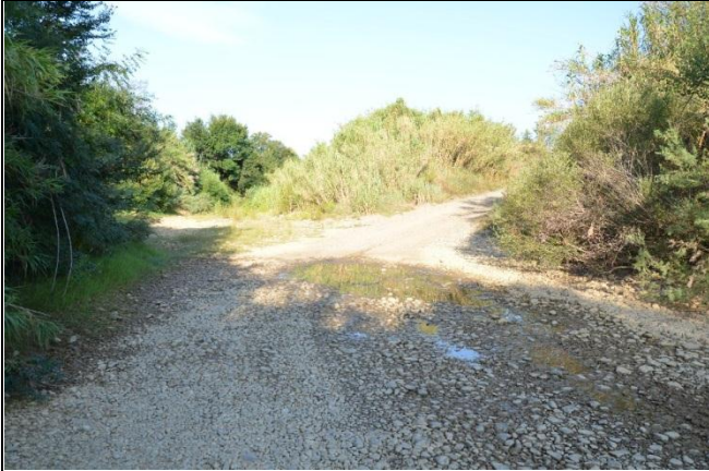
1) A ford on River Cornia, south of Monte Peloso.