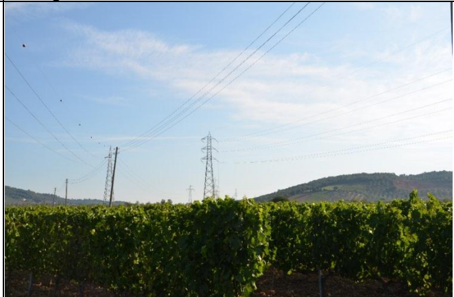
4) One of these steel powerlines could have been the one followed by Lt Marks and his platoon. The two steel ones reach the base of the mountain.