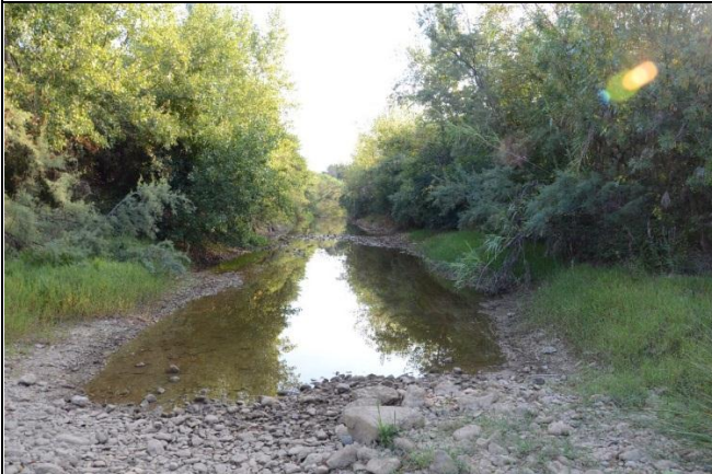
3) The "not so dry bed" of River Cornia (towards east). If the River had the same configuration in 1944, it could give some concealment to the advancing troops.